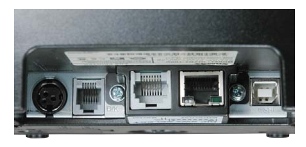
Triple Interface Standard

Distinctive in it's small size the Giant 100 has the features and speed of much larger 3" printers.