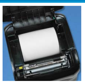
Drop and Print Paper Loading – Optional Paper Width Selector Allows 58mm Wide Paper Rolls