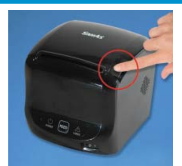
Designed for Jam-Free Operation