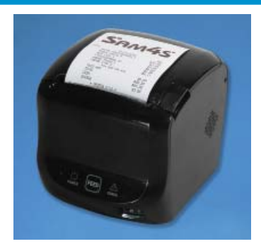
The Giant 100 Accommodates Up to 3" Wide Thermal Receipt Paper