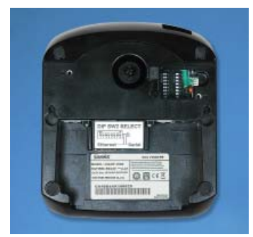
Easy Access to Dip-Switches / Tool-Free Access Optimizes Serviceability