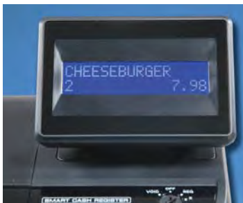
SAM4s ER-945 and ER-920 shown with optional card reader.

An extremely cost-effective and environmentally friendly bundle – each ER-900 series register includes a high quality cash drawer, high-speed thermal printer(s), and a rear customer display.