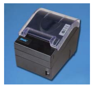
Optional Spill Cover