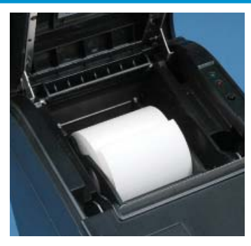
Drop and Print Paper Loading with an Adjustable Paper Width Selector