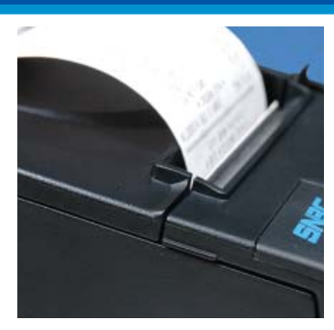
Liquid Guard Built Into the Cabinet Design