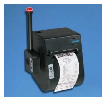
Built-In Wall Mount Capability and Optional Audio/Visual Print Messenger