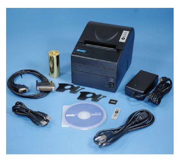
Contains Everything Necessary – Including the Communications Cables - in the Carton