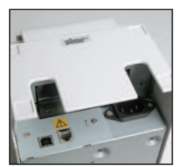
Embedded Power Supply