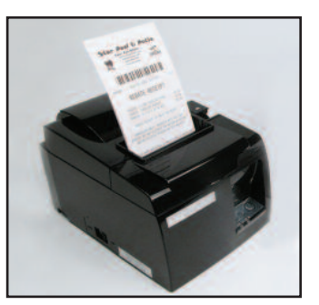
Sophisticated, High Gloss Cover

Visit www.starmicronics.com to learn more.