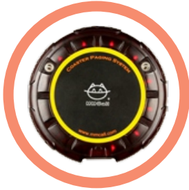
Coaster: one per guest