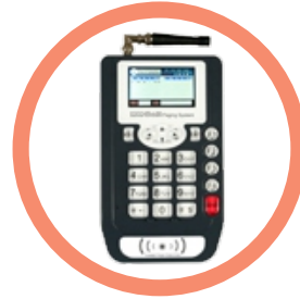
T20 Host: one per location